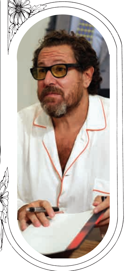
JULIAN SCHNABEL PMC 458 FAME GAME 113