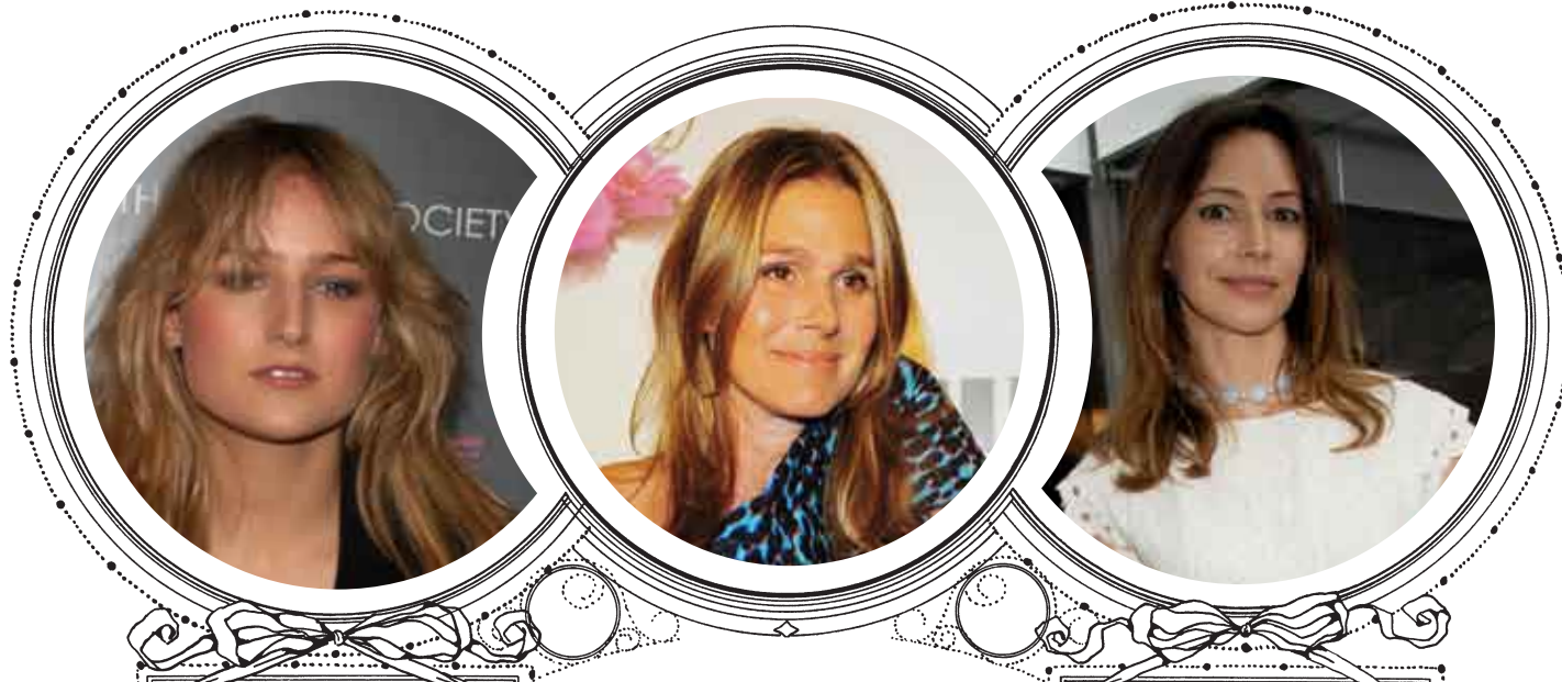
UPPER LEFT LEELEE SOBIESKI PMC 217 FAME GAME 2745