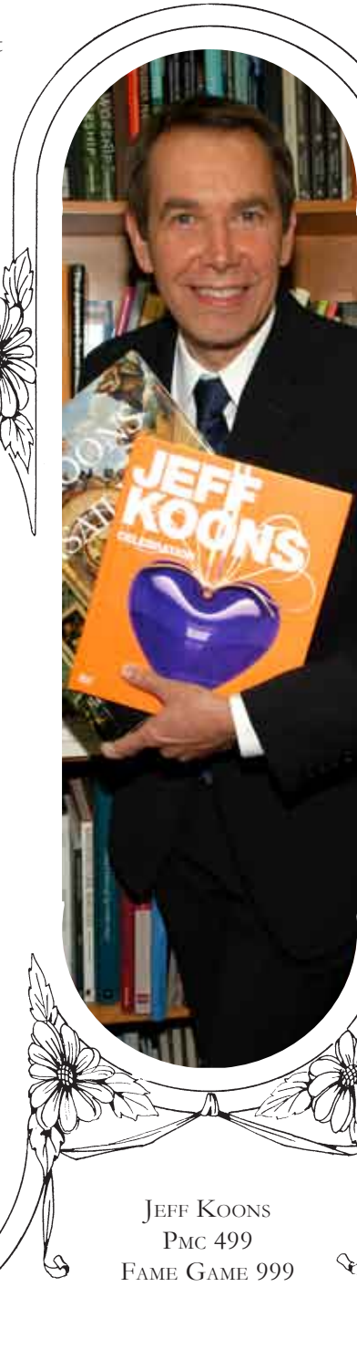
JEFF KOONS PMC 499 FAME GAME 999