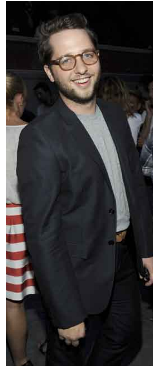
DEREK BLASBERG PMC 1056 FAME GAME 44