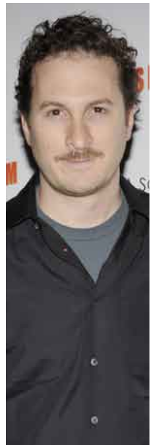
DARREN ARONOFSKY PMC 76 FAME GAME 405